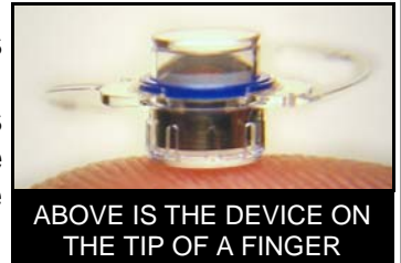
ABOVE IS THE DEVICE ON THE TIP OF A FINGER

Ophthalmic Consultants of Long Island (OCLI), is one of 14 initial sites nationwide where doctors will implant the miniature telescope. While it does not cure AMD, a leading cause of blindness in the elderly, it will help those who are legally blind resume reading, recognize faces and hopefully, increase their level of independence.