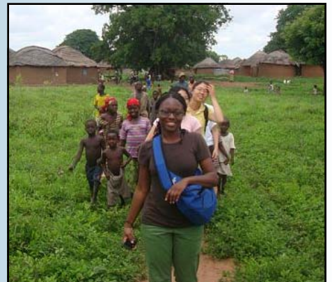
Nadimire in Ghana